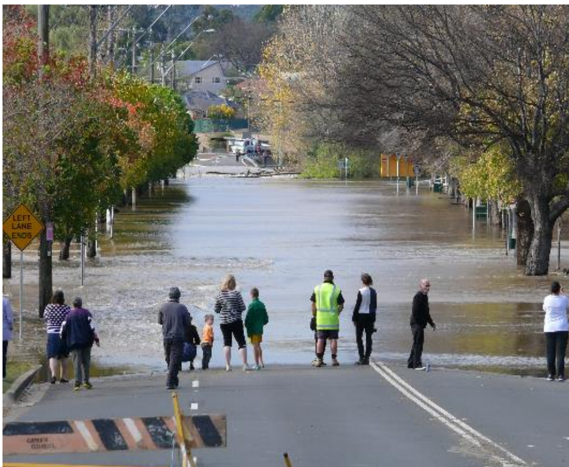
Flooding in 2016 -Cowpasture Bridge under water.