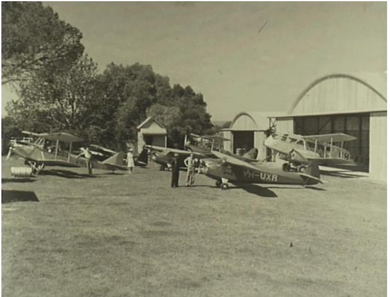
Camden Aerodrome, general scene of people and planes at the airport in 1938.

After the war, the Macarthur -Onslow family encountered difficulties in trying to reclaim their property and the airport went through several periods of development. A control tower was built in 1962 and the main runway was sealed in 1978. For a while it was home to the Camden Museum of Aviation (1968-1976). In 2003 the airport was sold to a private company.