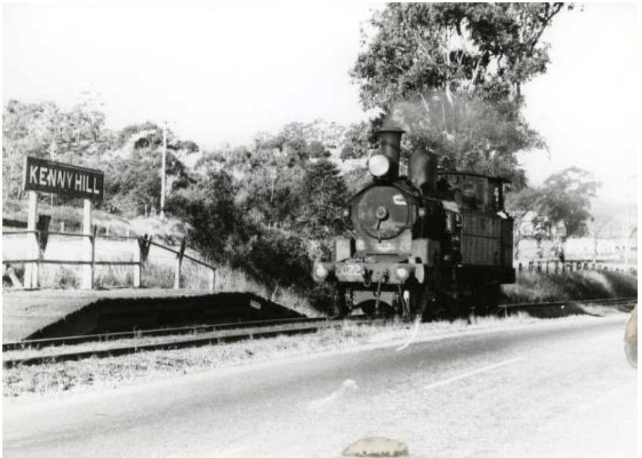
Pansy, the Camden train at Kenny Hill siding

In the meantime, Camden was becoming a major producer of dairy products. It already was an established wool and wine growing area. A tramway was built, and the “Pansy” train provided transport for people and produce Camden to Campbelltown. After World War 1, trains began carrying milk. Dairy Farmers opened a major stop was in Argyle Street at its milk depot. There were 8 sidings/stations along the way after leaving Campbelltown :- Maryfields, Kenny Hill, Currans Hill, Grahams Hill, Narellan, Kirkham, Elderslie, and Camden.