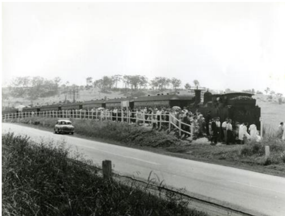
Pansy at Maryfields with passengers for the 'Way of the Cross'.

As road transport improved and family cars became more common, much of this area's produce, including coal, no longer needed the Pansy train service. It had been running at a loss for a number of years. The Pansy train operated from 1882 until it was closed by NSW State government in 1963.