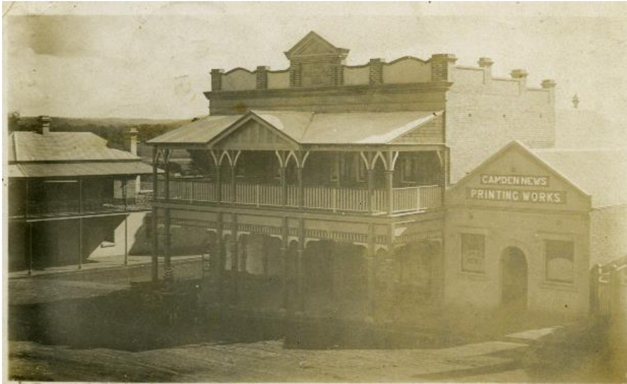
Camden News Building with Foresters Hall to the left in Argyle Street.