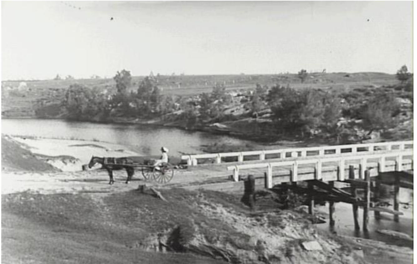
Menangle Bridge. Early wooden bridge over the Nepean River, with woman and sulky. 1910s.