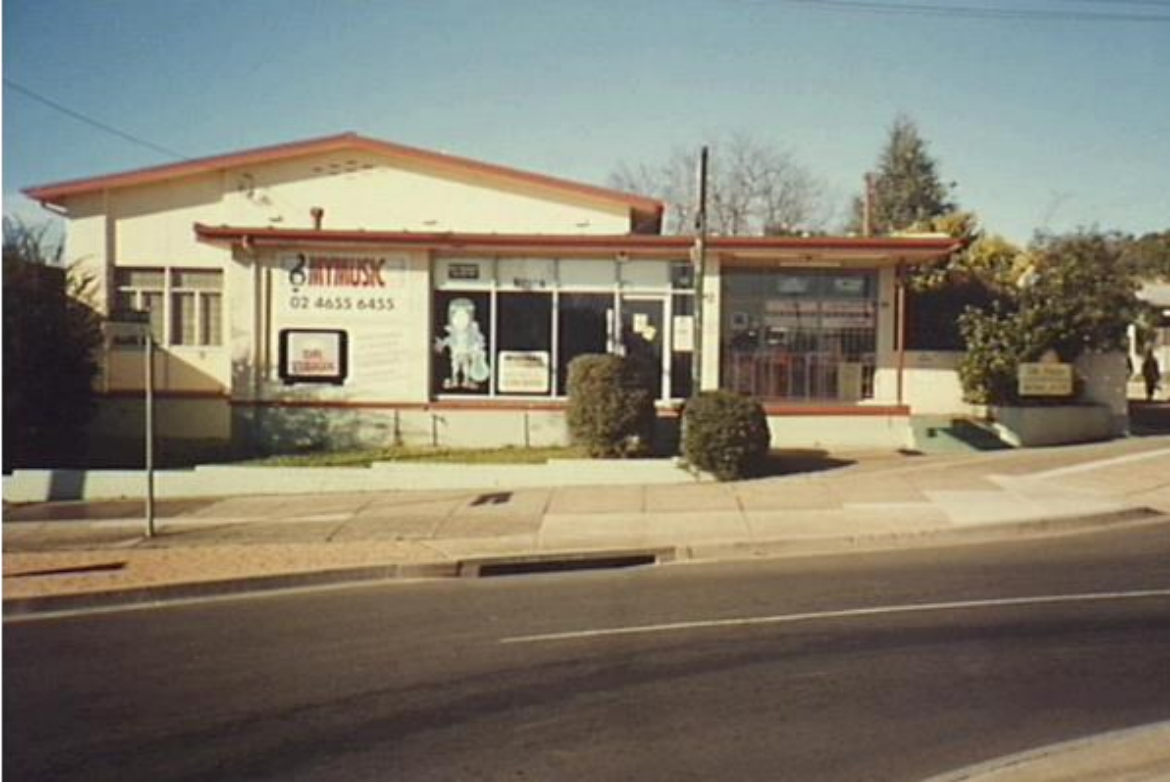
Location of 1 st automated Telephone Exchange, cnr View and Argyle Streets. c. 1998