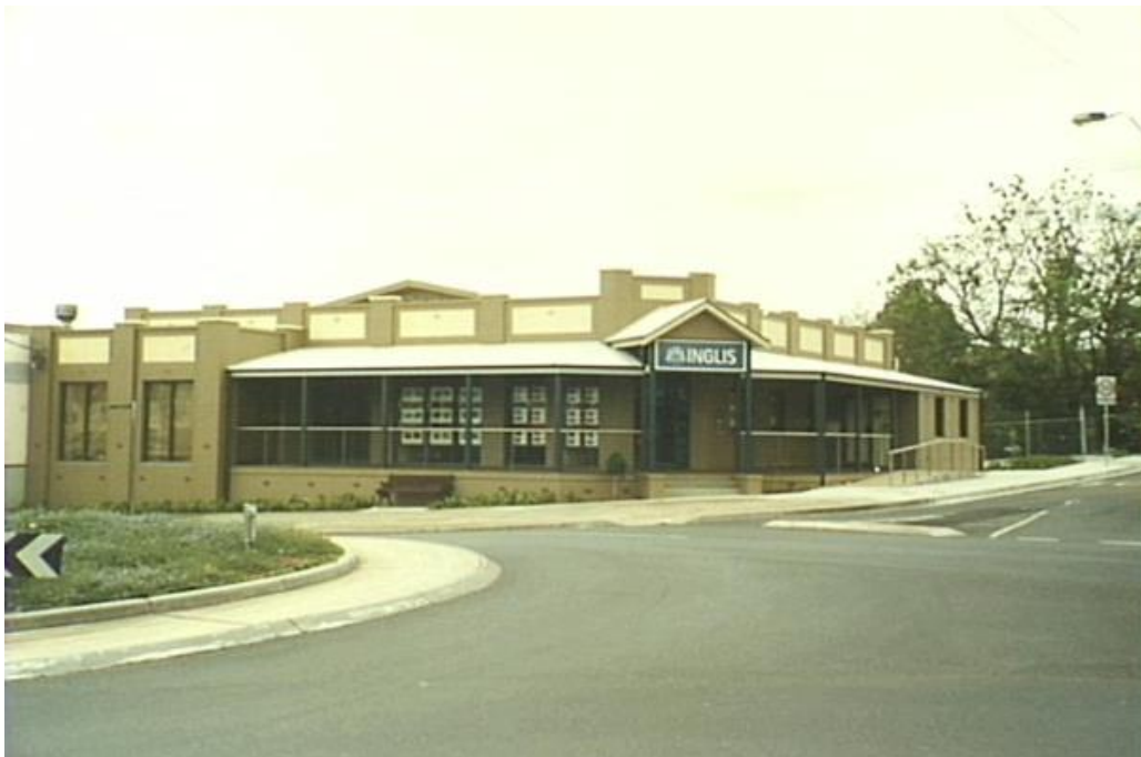
Inglis building, renovated site of the 1 st automated Telephone Exchange in Camden c. 2004

Later this building was used for other retail purposes and eventually was remodelled and became the Camden office of the Inglis family.