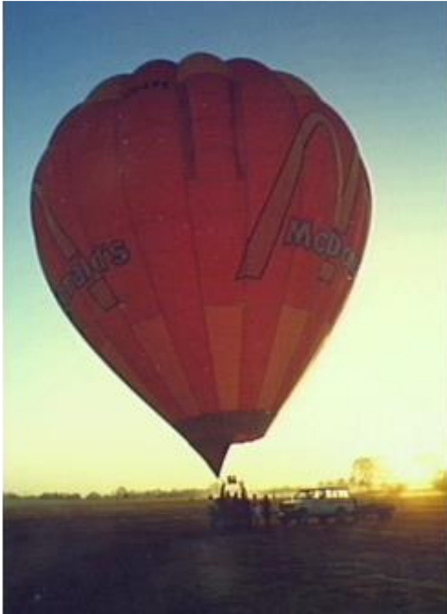
Hot air balloon ready for take-off at Camden airport. c. 1993