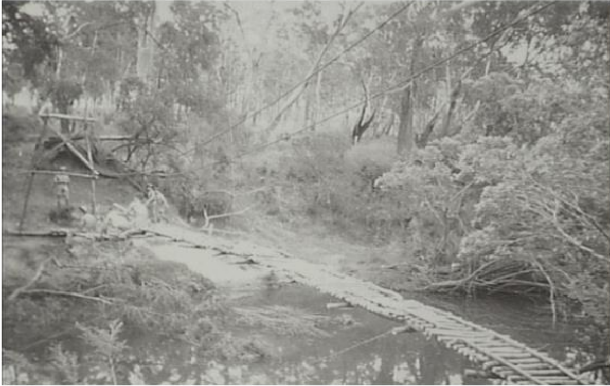
Little Sandy Bridge. Under construction by Army personnel c.1940s