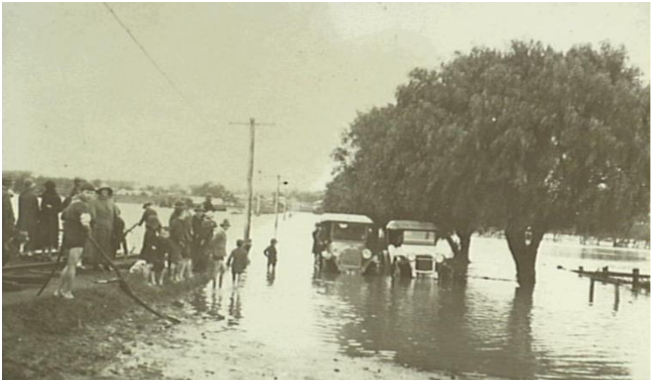
Flooding in Camden, Aryle Street outside the Milk depot c. 1925

at least 5 feet of water to flow above the Cowpasture Bridge causing a 'complete blockage for the railway and mail'.