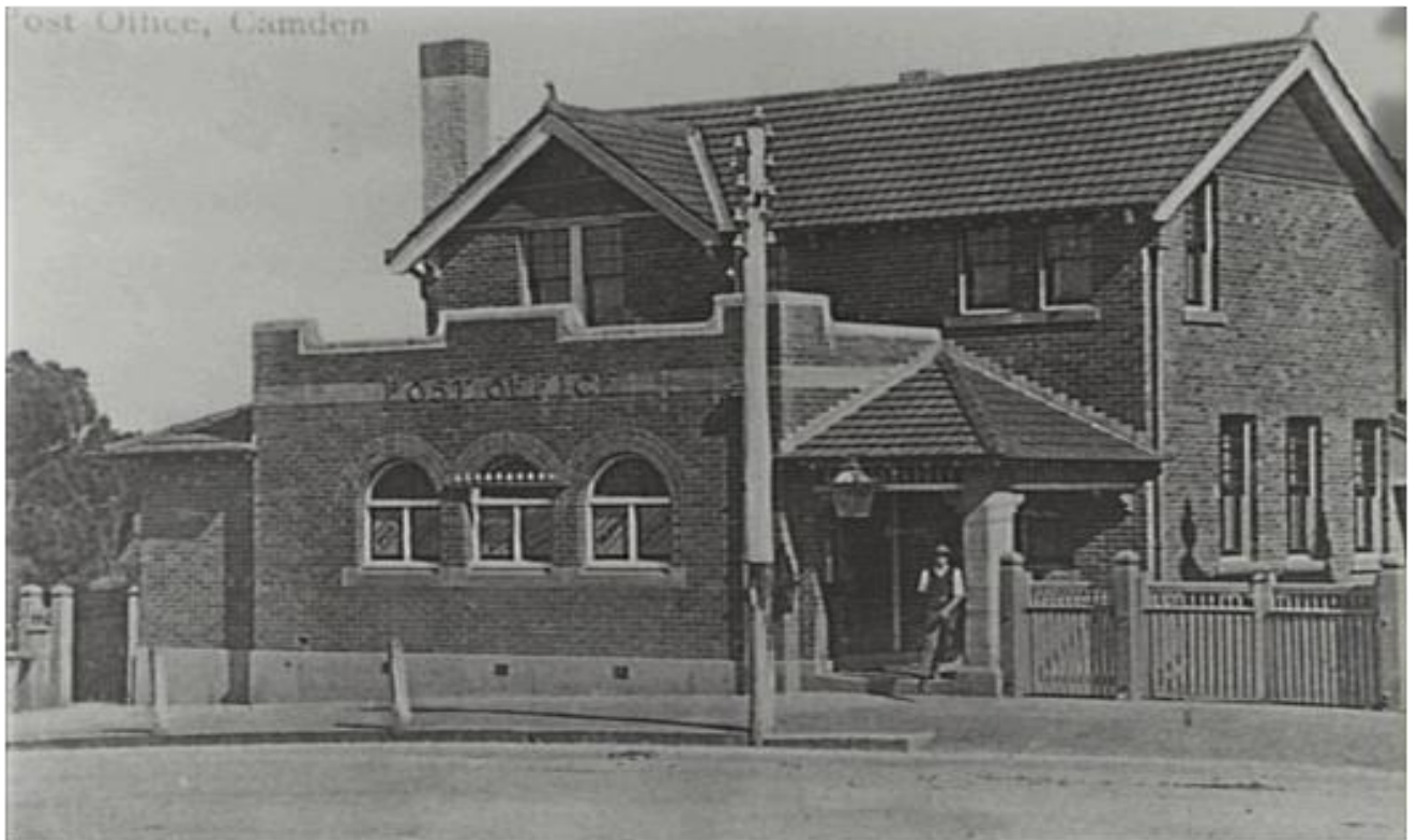
Camden Post Office. 135 – 143 Argyle Street, Camden c. 1905.